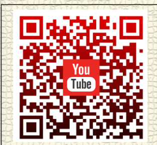
PHOTO STORY AND SCHOOL LIPDUB